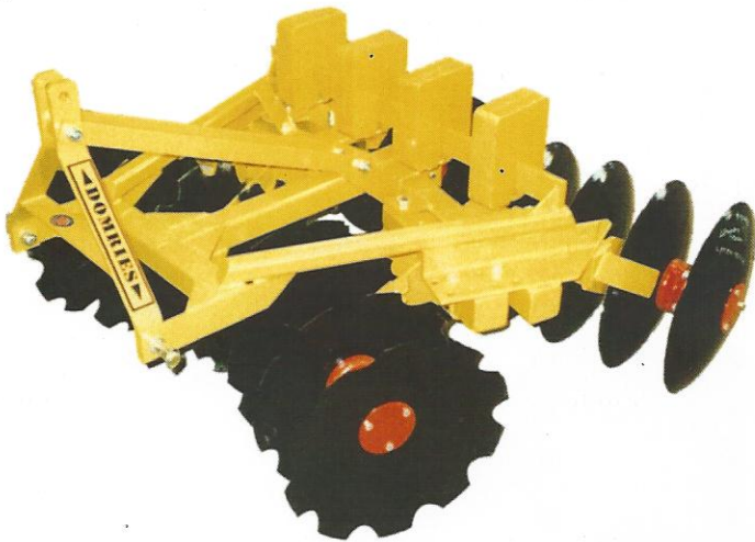
LPT 552 F 8 FT. MODEL WITH NOTCHED BLADES ON FRONT