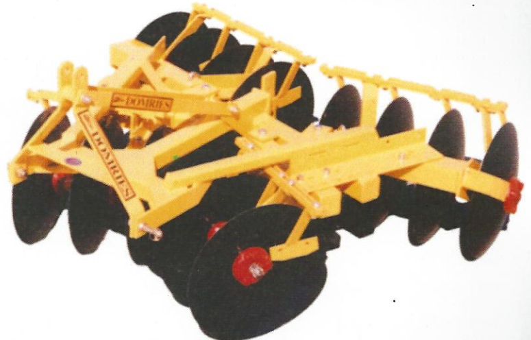
LPT 552 F SHOWING THE SMOOTH LINES AND LOW PROFILE THAT WILL WORK NEXT TO AND UNDER THE VINES